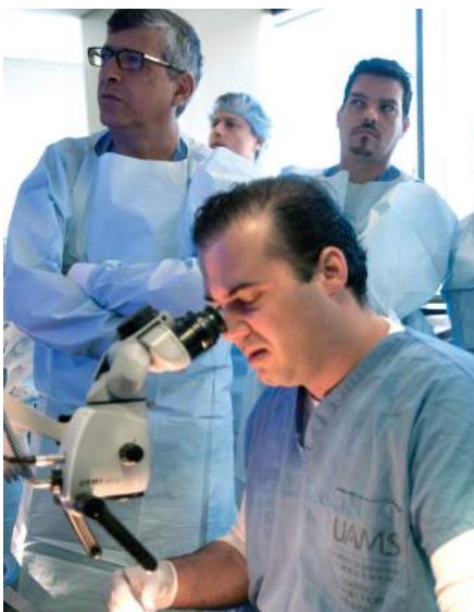
■ J. Thomas May Center for ALS Research – only research for amyotrophic lateral sclerosis in Arkansas