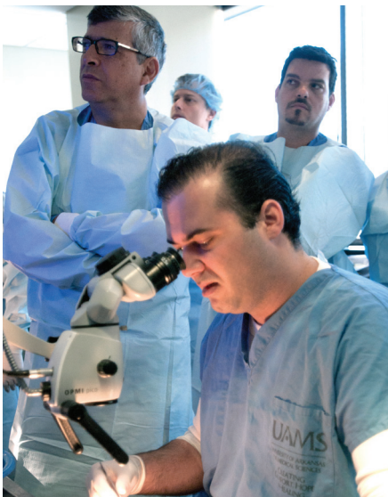
■ J. Thomas May Center for ALS Research – only research for amyotrophic lateral sclerosis in Arkansas